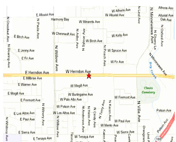
RENTAL HOUSING NEAR THE CLOVIS CAMPUS A one bedroom apartment near the campus is estimated to cost $1,400.00 per month in U.S. Currency.

The Clovis Campus is open Monday through Thursday, from 6:30 am to 10:30 p.m. and Fridays from 8:00 a.m. to 5:00 p.m. Classes are scheduled from 6:30 a.m. to 10:30 p.m., Monday though Thursday, and 7:00 a.m. to 4:15 p.m. on Fridays.