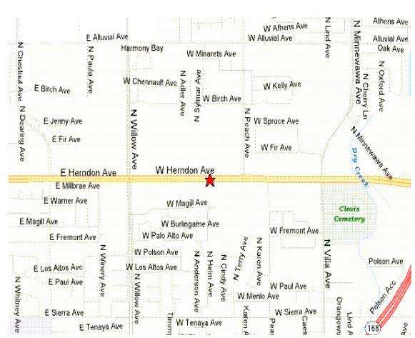
RENTAL HOUSING NEAR THE CLOVIS CAMPUS A one bedroom apartment near the campus is estimated to cost $1,400.00 per month in U.S. Currency.

The Clovis Campus is open Monday through Thursday, from 6:30 am to 10:30 p.m. and Fridays from 8:00 a.m. to 5:00 p.m. Classes are scheduled from 6:30 a.m. to 10:30 p.m., Monday though Thursday, and 7:00 a.m. to 4:15 p.m. on Fridays.