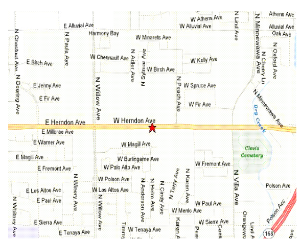
RENTAL HOUSING NEAR THE CLOVIS CAMPUS A one bedroom apartment near the campus is estimated to cost $1,400.00 per month in U.S. Currency.

The Clovis Campus is open Monday through Thursday, from 6:30 am to 10:30 p.m. and Fridays from 8:00 a.m. to 5:00 p.m. Classes are scheduled from 6:30 a.m. to 10:30 p.m., Monday though Thursday, and 7:00 a.m. to 4:15 p.m. on Fridays.